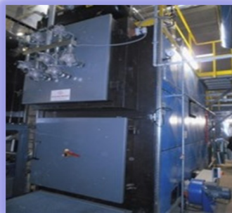
Mega Watt Biomass Boiler

“We had a full house for our 2nd 1MW—15MW Partner Conference, held earlier this month and welcomed a variety of key speakers from the industry to share their knowledge. We will be running another date in the early Autumn so watch this space!”