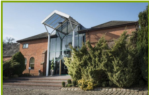
Latimer Place, Bucks

To find out more about the range of Mega Watt boilers now available in the UK market, please contact BGI directly.