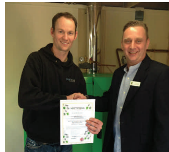
Practical training in the BGI Installer Training Showroom